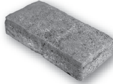
12,87 po (L) x 6,42 po (l) x 2,76 po (P) 327mm x 163mm x 70mm