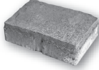
9,65 po (L) x 6,42 po (l) x 2,76 po (P) 245mm x 163mm x 70mm