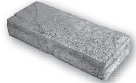
16,10 po (L) x 6,42 po (l) x 2,76 po (P) 409mm x 163mm x 70mm