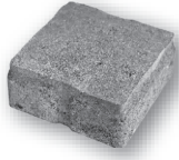
6,42 po (L) x 6,42 po (l) x 2,76 po (P) 163mm x 163mm x 70mm