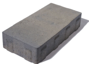
Small Rectangle Length: 330 mm ( 13" ) Width: 165 mm ( 6.5" ) Thickness: 70 mm ( 2.76" )