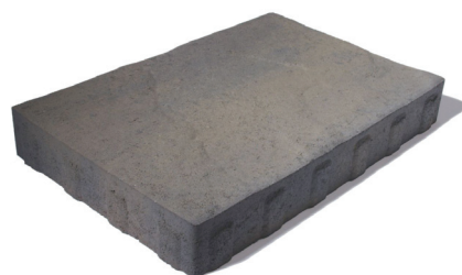
Large Rectangle Length: 495 mm ( 19.5" ) Width: 330 mm ( 13" ) Thickness: 70 mm ( 2.76" )