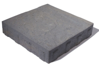
Square Length: 330 mm ( 13" ) Width: 330 mm ( 13" ) Thickness: 70 mm ( 2.76" )